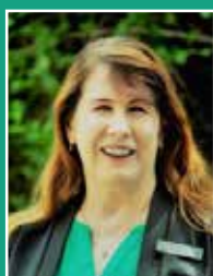
Licensed Real Estate Agent