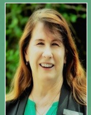
Licensed Real Estate Agent