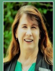
Licensed Real Estate Agent