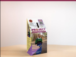
Project Compassion Box