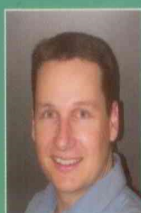
Licensed Real Estate Agent Stock & Station Business Agent