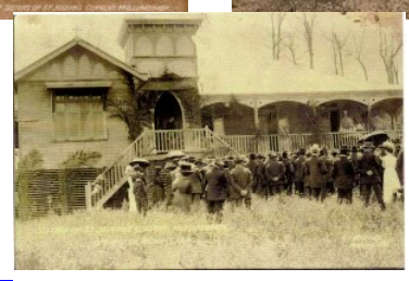
« < 1 of 3 > »