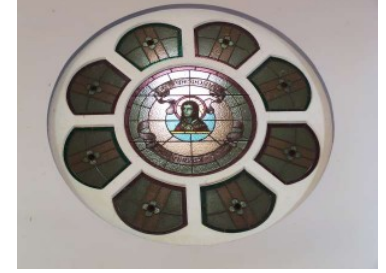
« < 3 of 3 > »