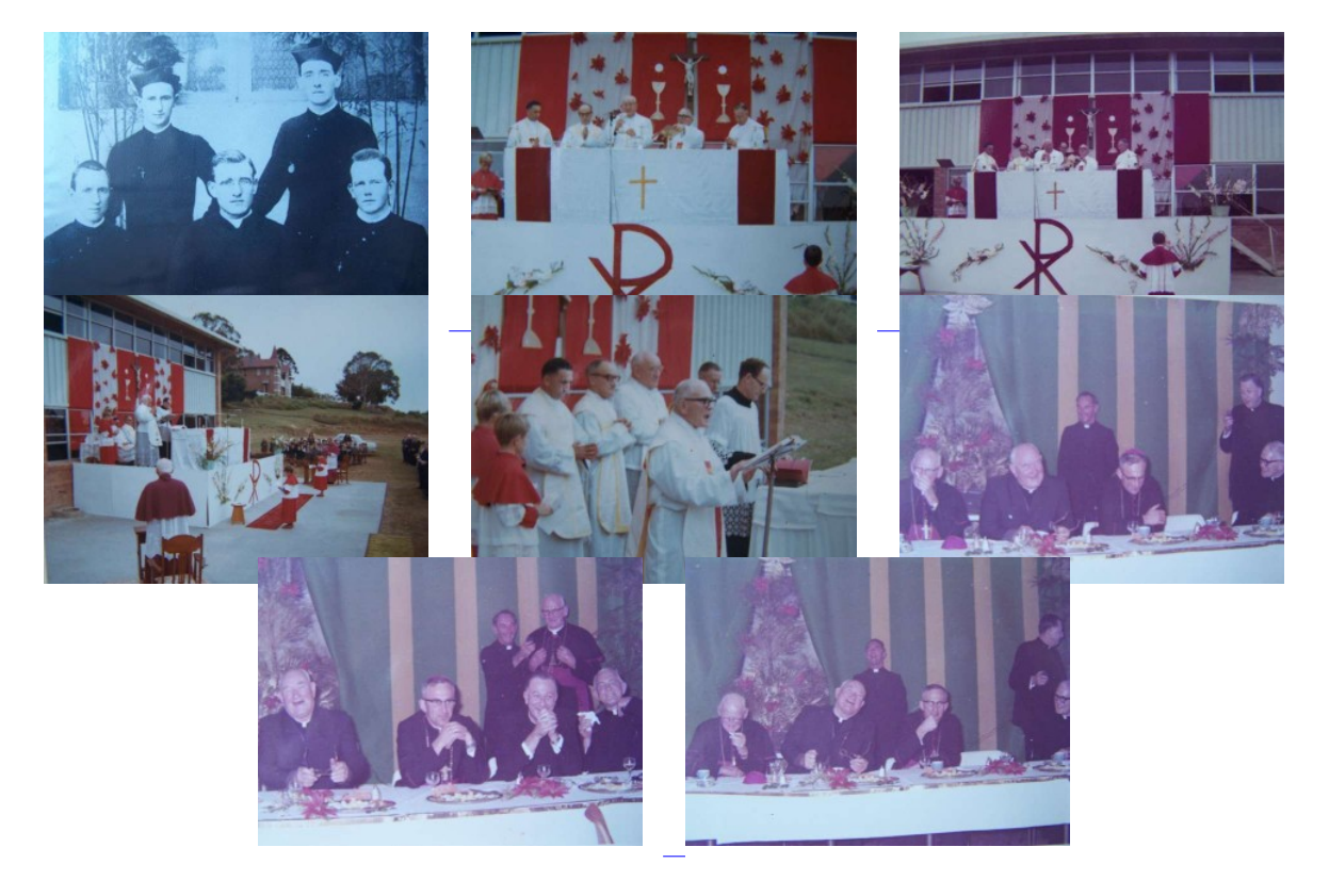
« < 1 of 3 > »