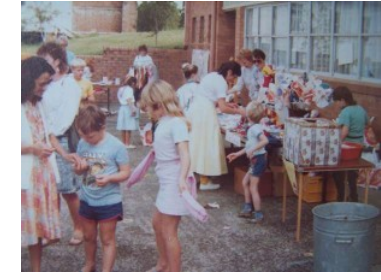
« < 5 of 10 > »