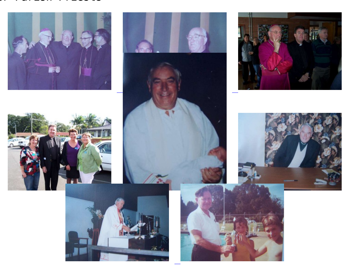
« < 2 of 3 > »