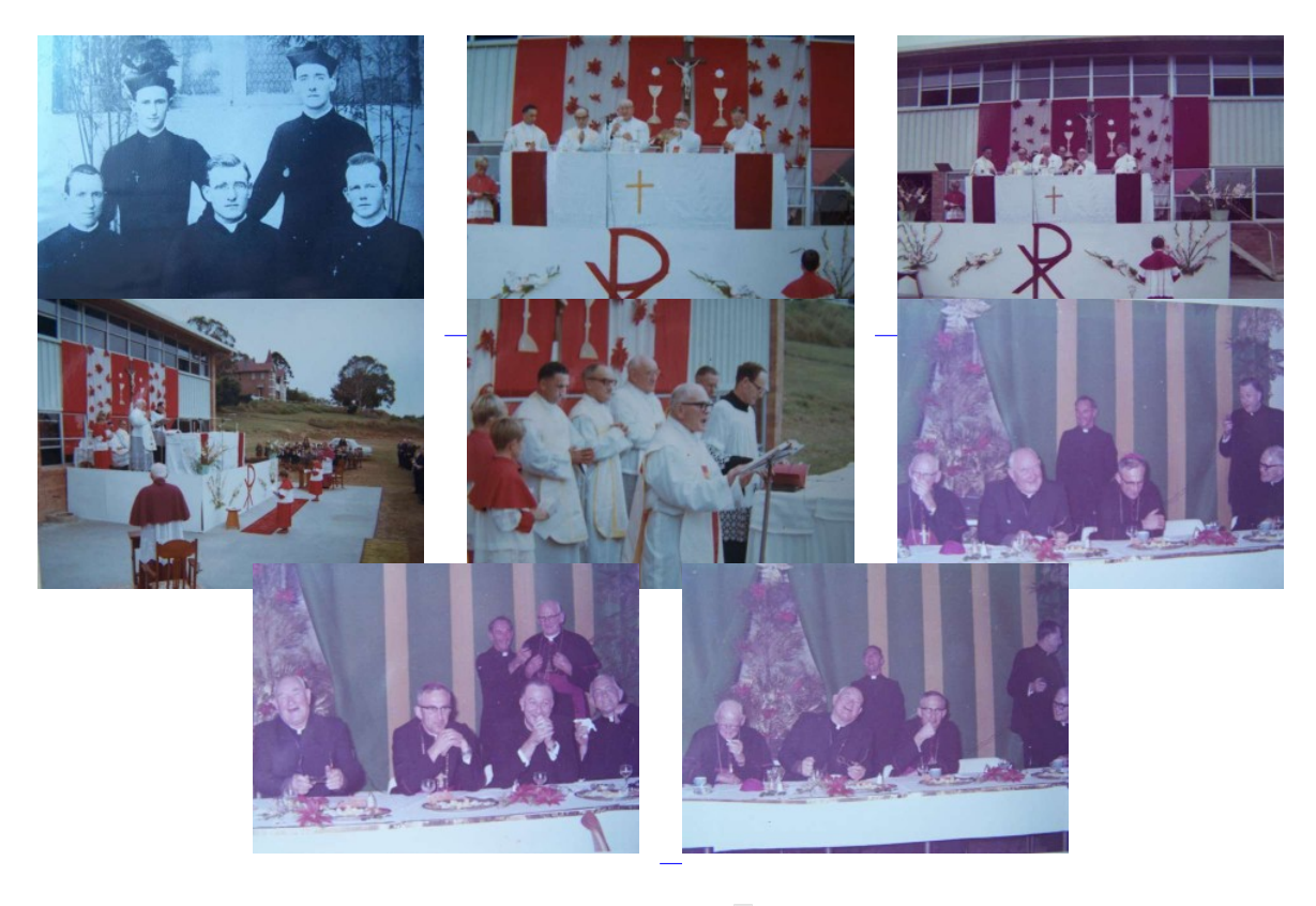
« < 1 of 3 > »