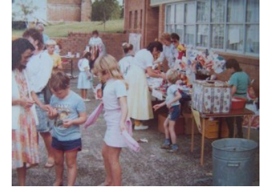
« < 5 of 10 > »