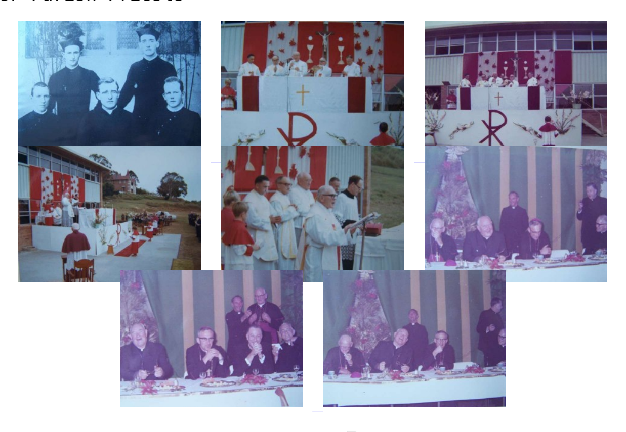
« < 1 of 3 > »