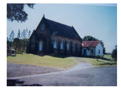
« < 3 of 10 > »