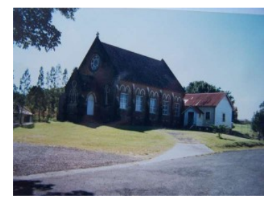
« < 3 of 10 > »