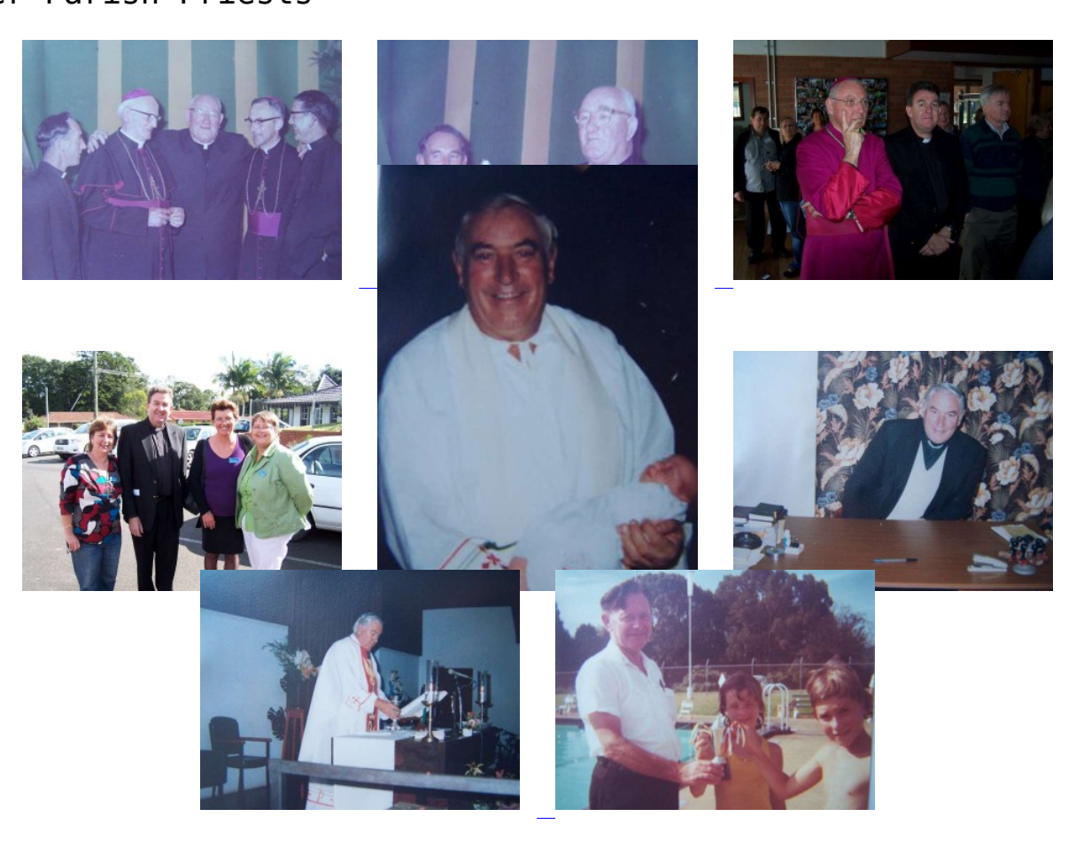
« < 2 of 3 > »