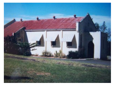
« < 2 of 10 > »