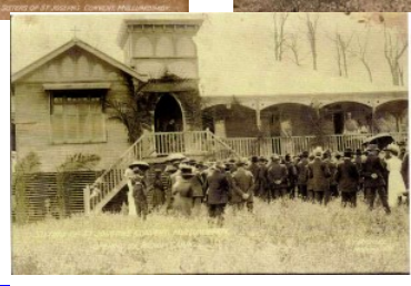
« < 1 of 3 > »