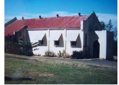
« < 2 of 10 > »