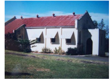
« < 2 of 10 > »