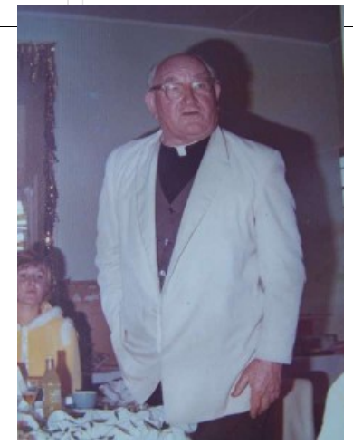
« < 3 of 3 > »