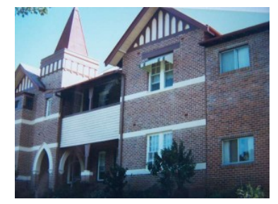
« < 4 of 10 > »